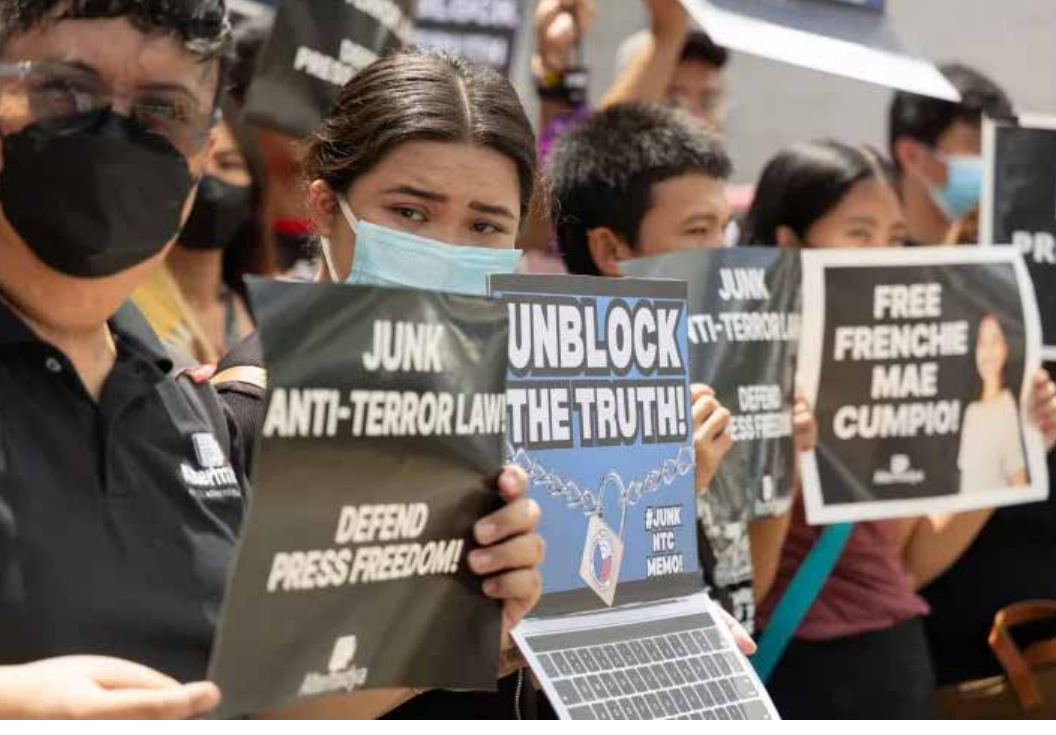
Journalists and advocates reiterate call for the junking of the Anti-Terror Act in a protest in July 2023.

presentations" released by the military, a frequent name in the controversial media network SMNI, and attacked by trolls and government officials in social media posts to senate hearings. Yet perhaps the worst was the blocking of its website.