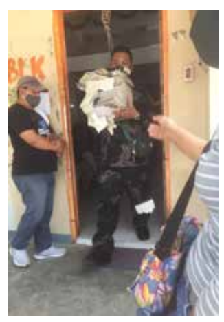
A policeman confiscates copies of Pinoy Weekly.

In July 2020, days after the feared anti-terror law took effect, the police confiscated copies of Pinoy Weekly magazines for being "subversive documents." The most challenged law in recent Philippine history, the anti-terror law was widely seen as a crackdown on dissent, punishing incitement, recruitment, and providing "material support" to a vaguely-worded crime of terrorism. Journalists were among the challengers of the law.