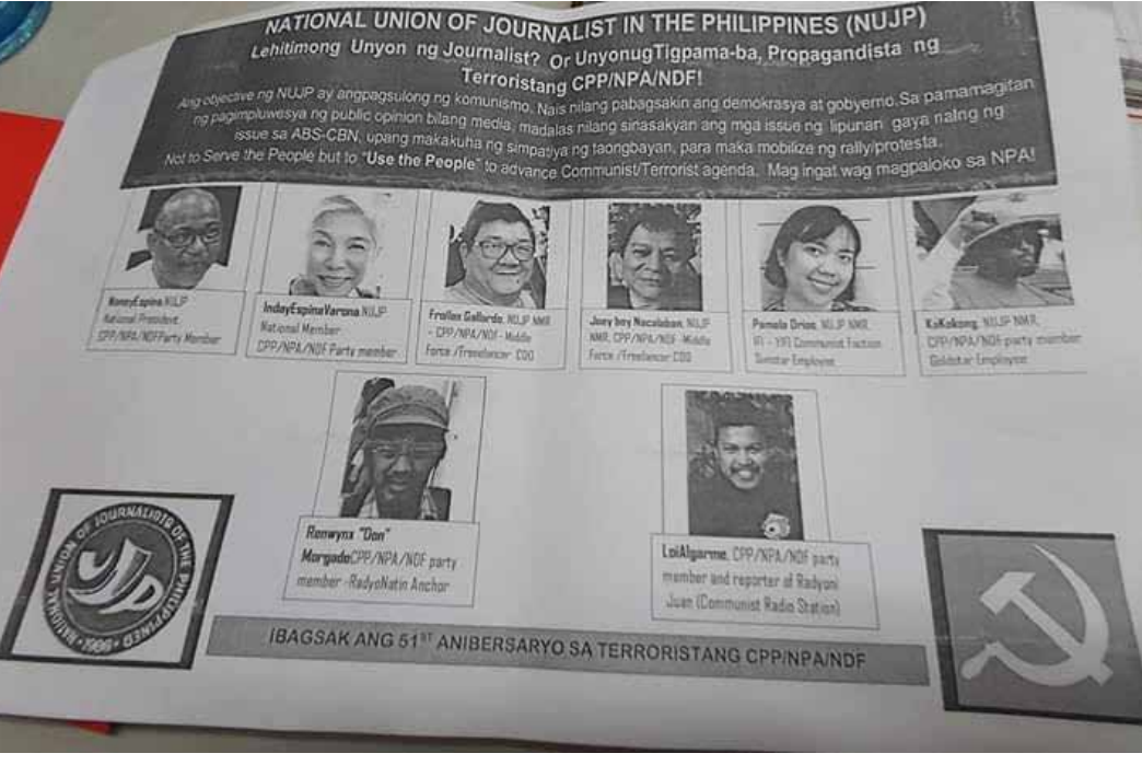
The pamphlet accuses the NUJP of speaking in behalf of and of being a propagandist of the Communist Party of the Philippines, the New People's Army, and the National Democratic Front.

"Gloria Macapagal-Arroyo's time was terrible when I was chair of the National Union of Journalists of the Philippines then," she recalls.