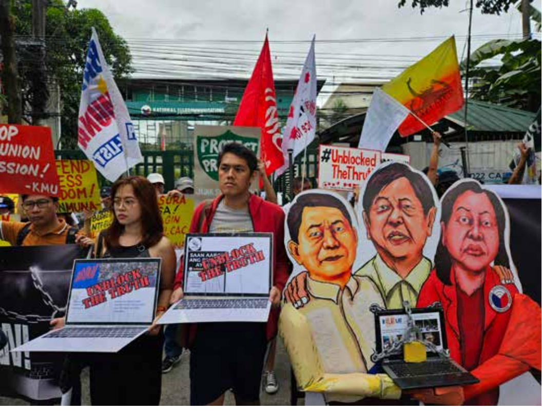
Press freedom advocates stage a protest in front of the National Telecommunications Commission.